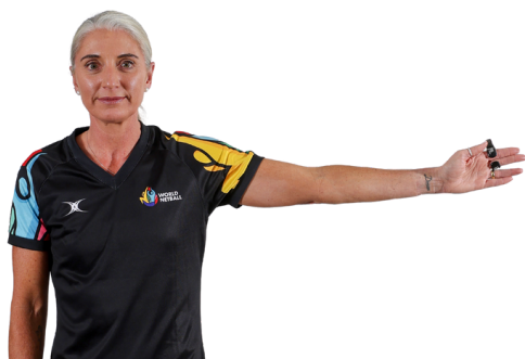
CENTRE PASS DIRECTION HAND SIGNAL