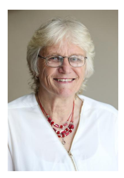
World Netball Service Award 2021