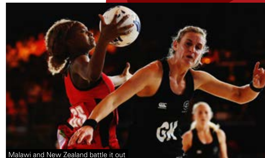
Malawi and New Zealand battle it out