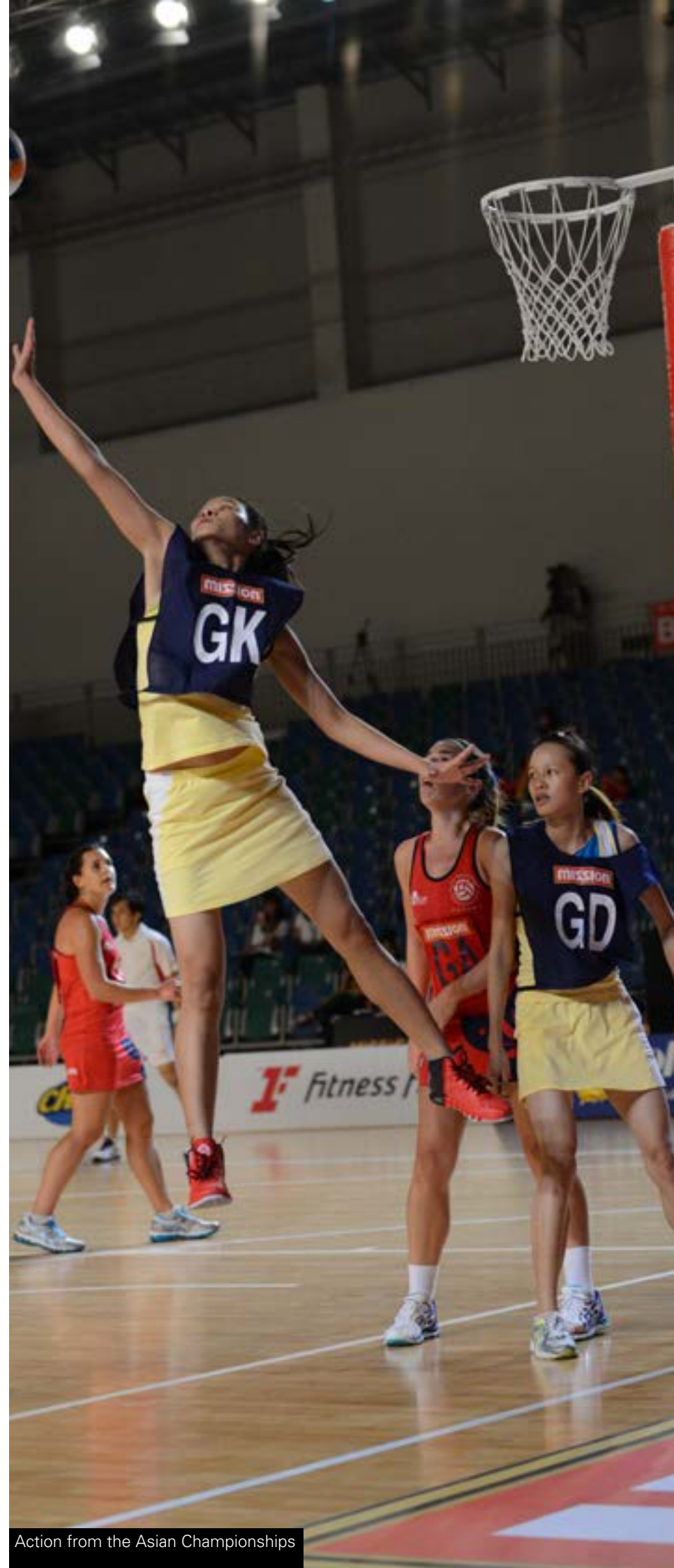
Action from the Asian Championships

The other country that has made really big strides in netball is Chinese Taipei. They only set up netball in 2008, but in the recently concluded Asian Netball Championships they came in a very strong fifth place, beating India in the play-off. They have shown much progress and are testament that newer member countries can be competitive if they continue to develop their team and grow the sport.