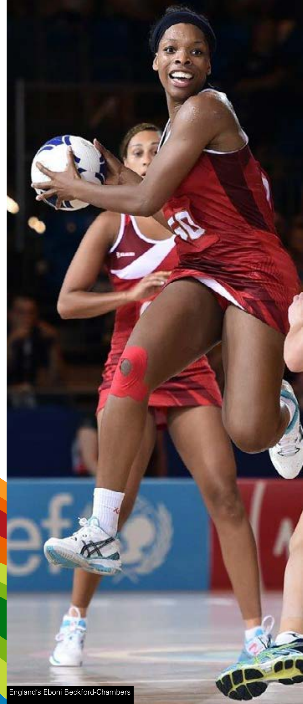
England's Eboni Beckford-Chambers