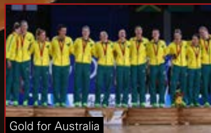
Gold for Australia

'We couldn't have had a better showcase for netball. We were able to demonstrate the quality and inclusiveness of the world's top women's team sport - not just to the wonderful people of Glasgow, but to a huge international media audience.'